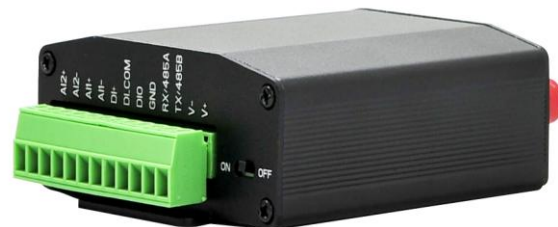
Dual Serial Port