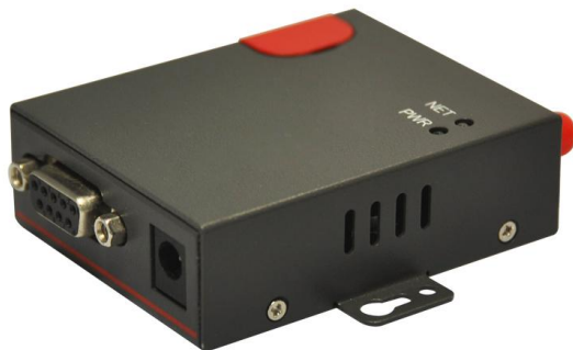
Single Serial Port

With the robust, reliable, long life and compact metal case design, the D80 DTU ideally adapts to onboard standard, easy to deploy and maintenance, it has been widely applied in many fields worldwide, such as power SCADA, oil field, coal mine, weather forecast, environment protection, water conservancy, heating, natural gas, petroleum and so on.